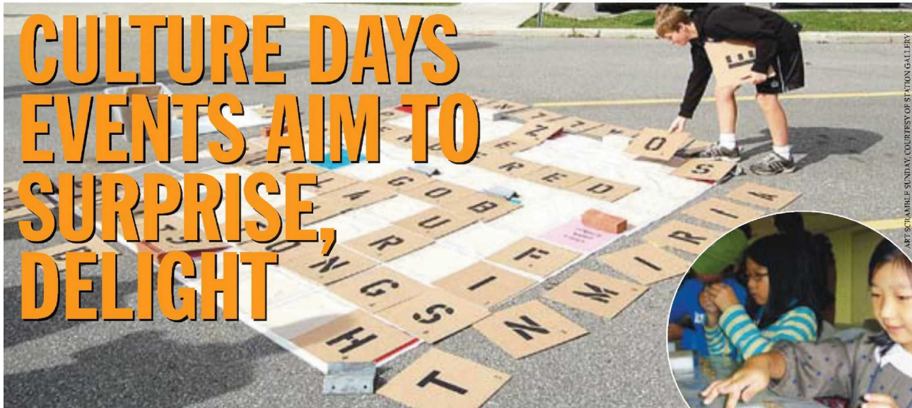
ARTS GALLERY MUSEUM