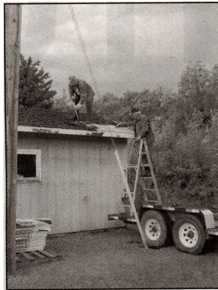
Allan Ivey and Ted Semchyshyn removed the old shingles from the storage shed