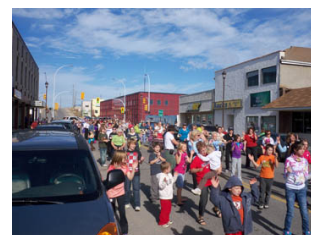
Dancing Down Main Street, Flin Flon, Manitoba.